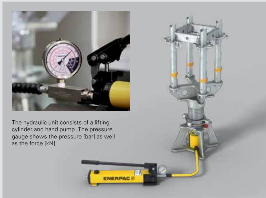
The hydraulic unit consists of a lifting cylinder and hand pump. The pressure gauge shows the pressure [bar] as well as the force [kN].

The 4-legged heavy-duty prop is comprised of system components from the PERI UP modular scaffold range and carries concentrated loads of up to 200 kN. The hydraulic cylinder in the base allows displacement and force-controlled lowering under load as well as systematic force-controlled pre-tensioning. The PERI UP Rosett Flex heavy-duty prop is suitable for shoring operations with high concentrated loads particularly when shoring in existing buildings.