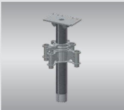
The head spindle provides an adjustment range of 55 cm and thus has the necessary flexibility for adapting to the condition of the building.